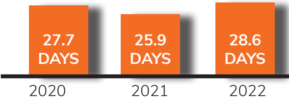
FY2020-FY2022 Gaylord Discharge Data