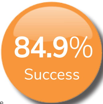
FY2022 Gaylord Patient Discharge Report

Accuracy Rating of Information Received Prior to Admission