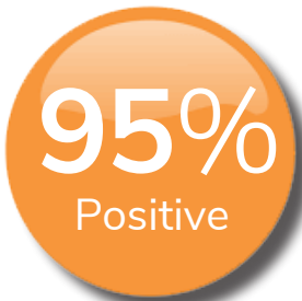
FY2022 Internal Patient Survey Data Top Boxes

Accuracy Rating of Information Received Prior to Admission