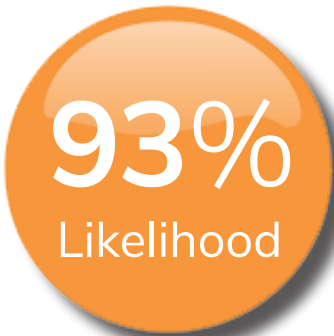
FY2022 HCAHPS (LTRAX) Top Boxes

Gaylord Stroke Patients are Likely to Recommend our Program