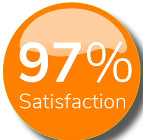
FY2022 Internal Patient Survey Data Top Boxes

My Care Team Included Me in Decisions Regarding Care, Treatment and Goal Setting