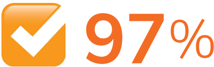
FY2022 Internal Patient Survey Data Top Boxes