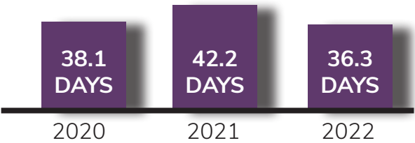
FY2020-FY2022 Gaylord Discharge Data