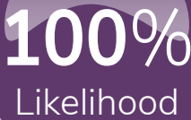
FY2022 Internal Patient Survey Data Top Boxes

My Care Team Included Me in Decisions Regarding Care, Treatment and Goal Setting