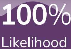
FY2022 HCAHPS (LTRAX) Top Boxes

Gaylord SCI Patients are Likely to Recommend our Program