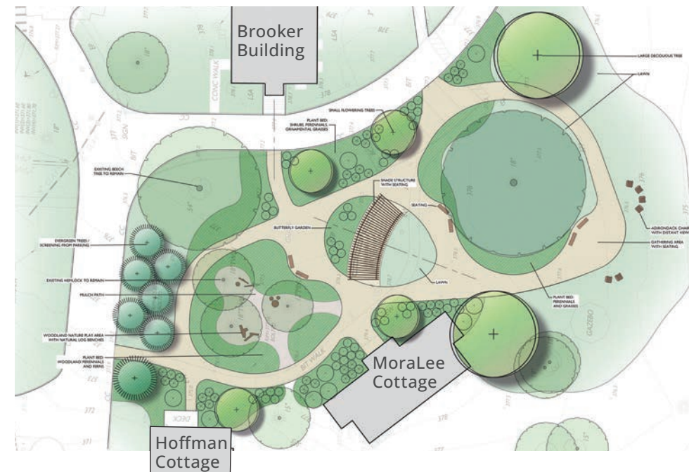
Diagram of planned Cottage Garden

Building on the success of the Rutledge Family Garden, in Spring 2024 Gaylord will break ground on a new garden in front of the family cottages. The space will serve as a sanctuary for relaxation and rejuvenation and an extension of our therapy offerings, providing additional outdoor space for patient therapy and family activities. This new garden will aid in stress reduction for patients, their families, and staff alike. Being in nature, or even viewing scenes of nature, reduces anger, fear and stress, and increases pleasant feelings. Exposure to nature not only makes you feel better emotionally, it contributes to your physical well-being, reducing blood pressure, heart rate, muscle tension, and the production of stress hormones. The integration of outdoor spaces into rehabilitation aligns with our commitment to enhancing the patient and family experience. By leveraging the restorative power of nature, we are advancing our capabilities and providing comprehensive patient care.