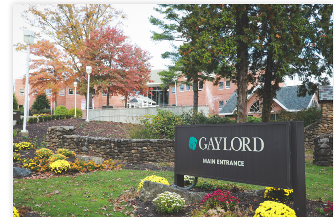
Gaylord's Jackson Outpatient Building