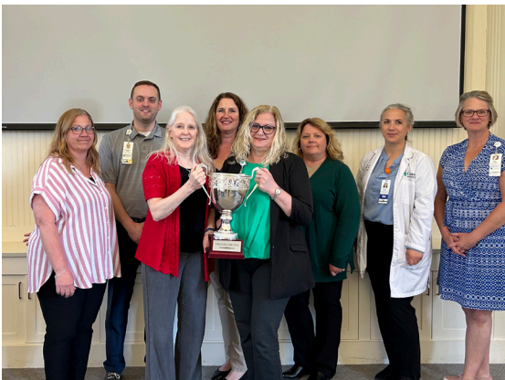
Note: Not everyone was present for the photo.