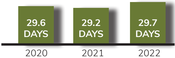
FY2020-FY2022 Gaylord Discharge Data