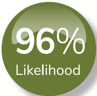
FY2022 HCAHPS (LTRAX) Top Boxes

Gaylord Brain Injury Patients are Likely to Recommend our Program