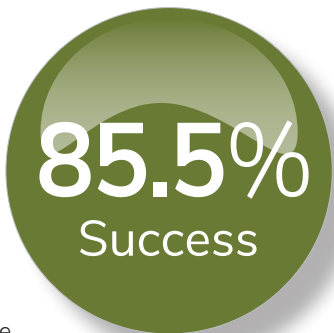
FY2022 Gaylord Patient Discharge Report