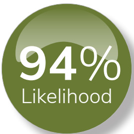
FY2022 Internal Patient Survey Top Boxes

My Care Team Included Me in Decisions Regarding Care, Treatment and Goal Setting