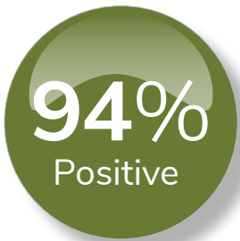
FY2022 Internal Patient Survey Top Boxes

My Care Team Included Me in Decisions Regarding Care, Treatment and Goal Setting